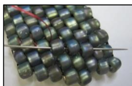
This shows the needle following the bead path.

This shows a change in direction. When the thread is pulled tight, the loop you see between the two beads (the red thread at the bottom of the picture) will no longer be visible.